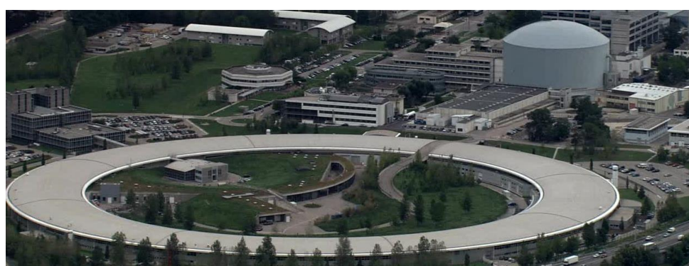
Large Scientific Facilities